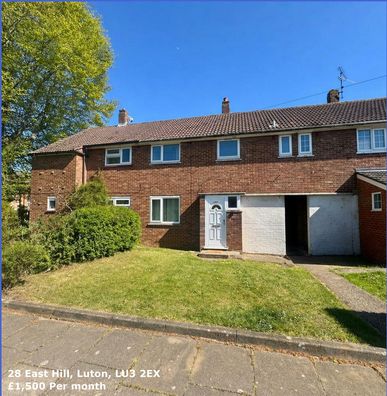
28 East Hill, Luton, LU3 2EX £1,500 Per month